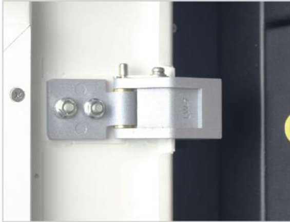
Advantage One: Specialized High-strength Hinges