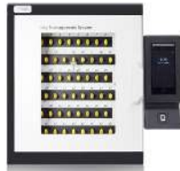
i-keybox-M Automatic Door