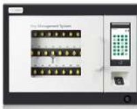
i-keybox-S Automatic Door