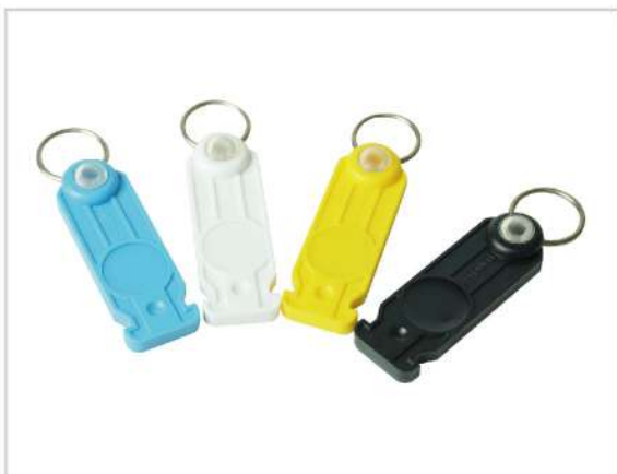
Advantage Three: Intelligent Key Tag